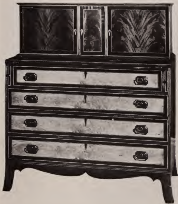
No. 136—BEAUTIFUL INLAID MAHOGANY AND CURLY MAPLE WRITING DESK ( American, XVIII Century )